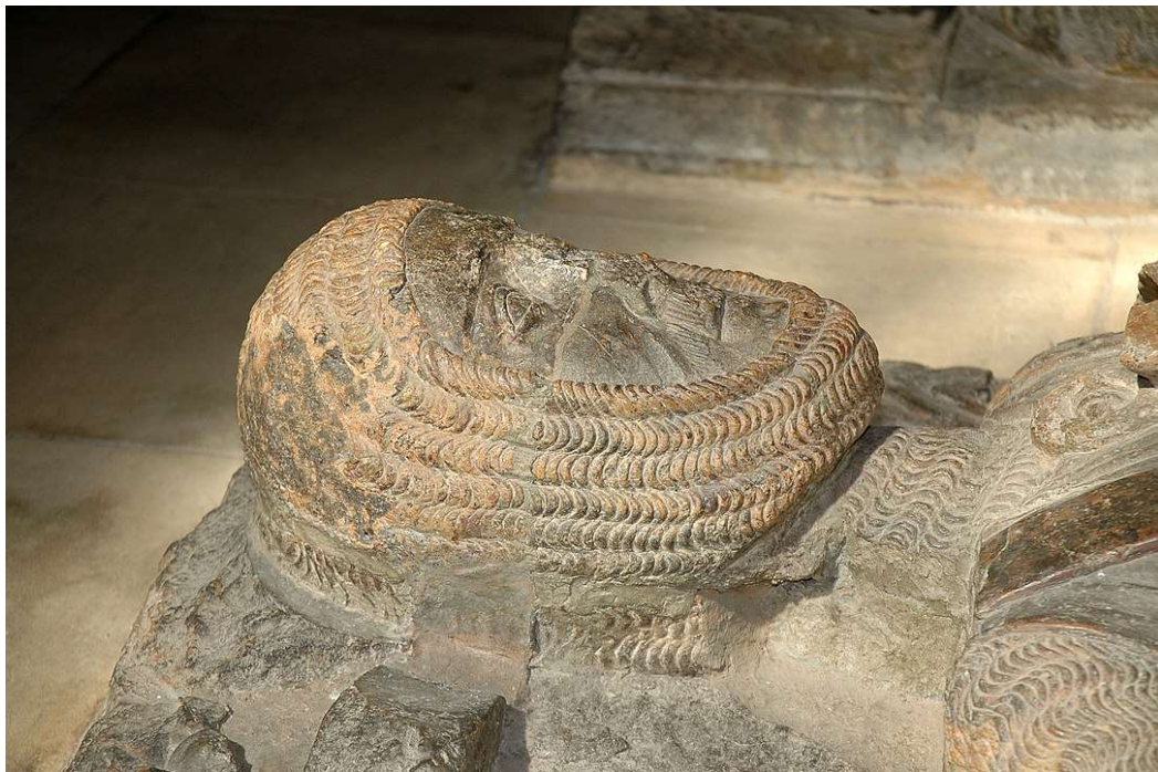
Head of the effigy of William Marshal, 1 st Earl of Pembroke, in Temple Church, London

How cool to be able to count Sir William Marshal (1146-1219) as one of my ancestors!